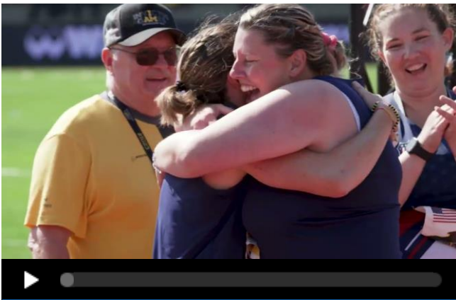
Invictus Games Dusseldorf 2023

We are honoured to have supported the 59 veterans and serving personnel, at the Invictus Games 2023, in partnership with the Ministry of Defence. The determination, strength, personal achievement and team spirit of every Team UK member was inspiring to see. The Invictus Games is about overcoming adversity, and making friendships that last a lifetime. Team UK won 29 Gold, 18 Silver and 21 Bronze medals. Take a look at their inspirational journey and moving support from their families and friends .