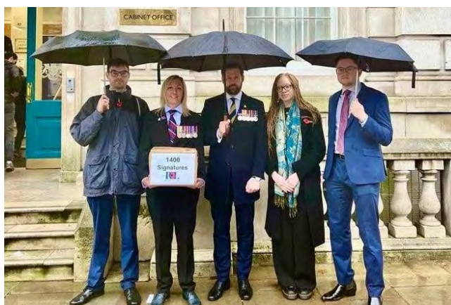
Veteran's Commissioner for England

Last year we launched a petition calling on the UK government to appoint a Veterans' Commissioner for England, as Commissioners in Scotland, Wales, and Northern Ireland are already dedicated to advocating for the veteran community. Over 1,400 supporters, including members, colleagues and volunteers signed the petition we delivered to the Office of Veterans' Affairs in December. Thanks to this work, the Government will appoint a Veterans' Commissioner for England. Read our official statement here . To hear more about our campaigns, sign up to our Campaigner Community .