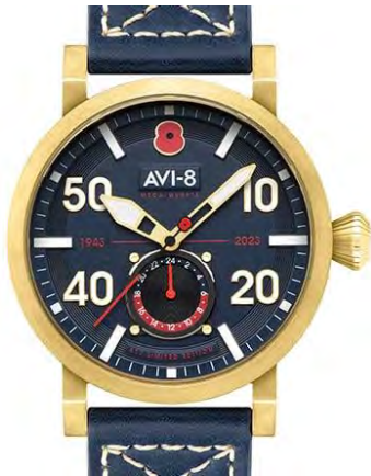
AVI Dambuster RBL watch

To commemorate the 80th anniversary of Operation Chastise and the valiant 617 Squadron, known as the Dambusters, AVI-8 is proud to release the Dambuster 80th Anniversary Royal British Legion Meca-quartz. This limited-edition timepiece pays tribute to the daring and skilful operation undertaken by the Royal Air Force (RAF) during World War II. The timepiece launches on 3rd November, but RBL members can sign up for early access here . £17 from every sale is given to RBL.