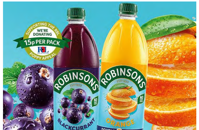
Britvic supports RBL

For each bottle of Robinsons 1L double strength Orange or Blackcurrant squash sold at Sainsbury's, 15p will go to RBL. Grab a bottle in stores or online from 1st November to 21st November to support our Armed Forces community!