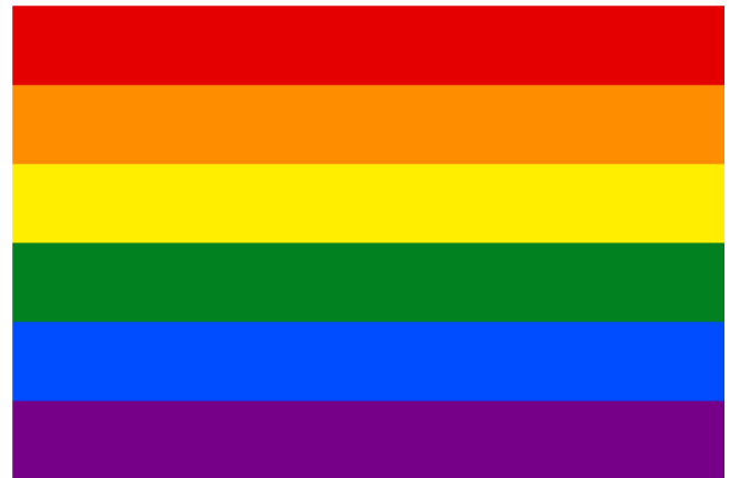
LGBTQ veterans independent review