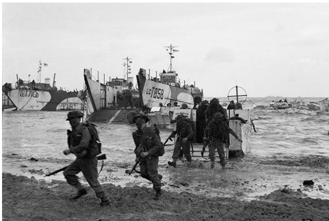
80th Anniversary of D-Day

RBL will be marking the 80th anniversary of D-Day with events in Normandy, as well as national and community events. The D-Day landings were the largest amphibious operation in history, which marked the beginning of the liberation of France and Western Europe. If you are a veteran, family member or carer, please register your interest using the link below. The deadline for submissions is 31 August.