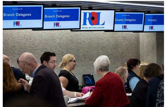
Register for Annual Conference - 10th - 12th May

Delegates and visitors can register to attend Annual Conference 2024 in-person or online. You can register online until 28th March. Activities start with the exhibition and Standard Bearers Competition on 10th May, followed by the opening of Conference on 11th May. Please note, online attendees will only be able to view the business of Conference. More information, the registration link and FAQs are available on the Annual Conference webpage .