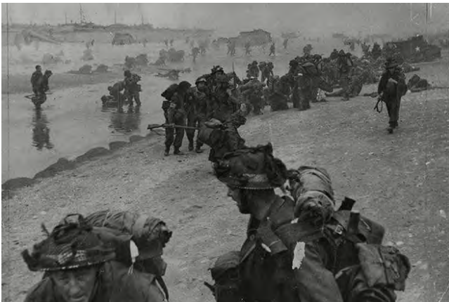
Commemorating D-Day 80th anniversary

2024 sees the 80th anniversaries of momentous turning points of WWII. The D-Day landings marked the beginning of the liberation of western Europe. Elsewhere, from Italy to Kohima and Imphal in India, hard-fought battles were turning the tide of the war. We're marking the service and sacrifice of those who fought in those battles, and are encouraging our members, branches, and communities to get involved in D-Day 80.