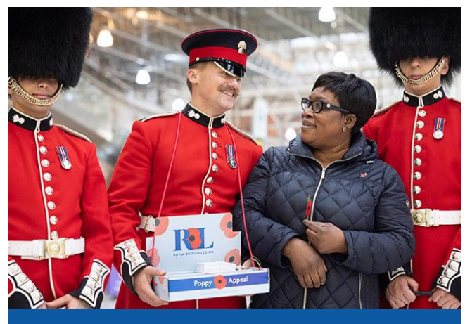
Join us for London Poppy Day 2024

London Poppy Day is RBL's flagship fundraising event for the annual Poppy Appeal. It's a one-day street collection, taking place this year on Thursday 31st October from 7am-7pm, that mobilises over 1,000 uniformed personnel from the Royal Navy, British Army, and Royal Air Force, plus 1,000 veterans, volunteers, and supporters. It's a unique opportunity for communities to engage with uniformed personnel. Join us for a few hours or more and be part of this exciting and unique day and help us raise vital funds to continue our work.