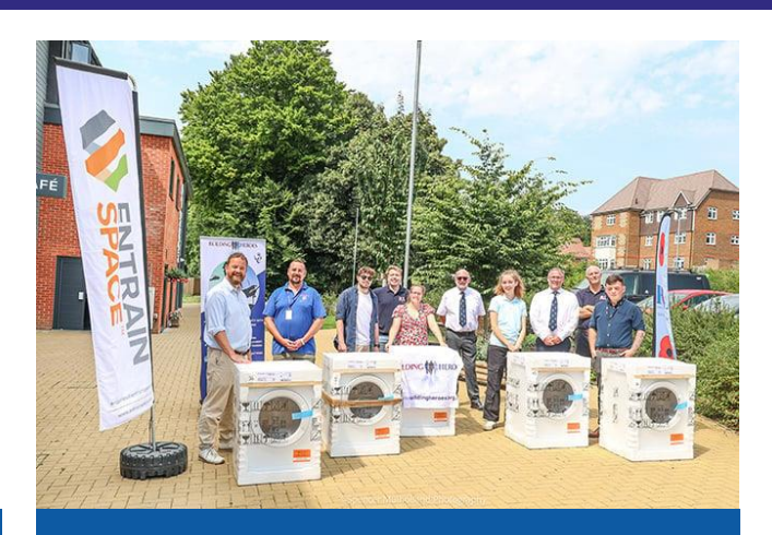
RBL helps fund independent living

RBL is recruiting a National Chair, National Vice Chair and three trustees for their Board of Trustees, and 12 representatives for the Membership Council. These roles are vital in helping to shape the leadership of the Royal British Legion. The election window is open from 1st October - 17th January 2025, with the successful candidates taking up their positions in May 2025. If you're interested contact us at <u>elections@britishlegion.org.uk</u>.