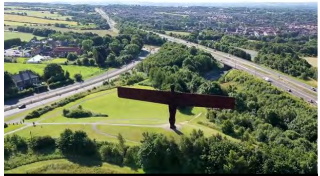
Documenting 100 years of local RBL history

The Northumbria County created a film and book to mark 100 years of supporting the local Armed Forces community. The film features Members including veterans sharing their experiences, centenary Branches receiving their pennants and last year's centenary event that took place at the Gateshead quayside and the Gateshead Millennium Bridge.