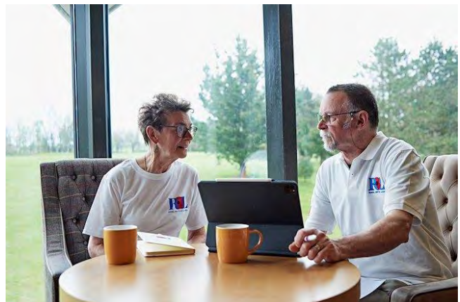
5 things you might not know about RBL clubs

It has been an honour and a privilege to have Queen Elizabeth II as our Patron since 1952. Representing all Members, 72 RBL Standard Bearers from across the UK, as well as Parade Marshals took part in the funeral procession, paying tribute to our late Monarch. Here is what some of these Standard Bearers said ahead of the Queen's funeral.