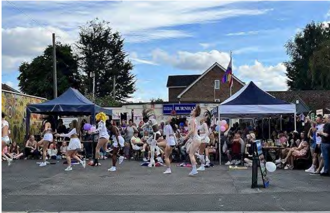
The Burnham RBL Club held its first Pride event

The Burnham RBL Club brought together their community, other charities and performers to celebrate diversity and inclusivity. They hosted an event with more than 70 attendees, who enjoyed dance and music performances, food and activities for people of all ages. Following this year's success, the Club Committee is planning to make this an annual event.