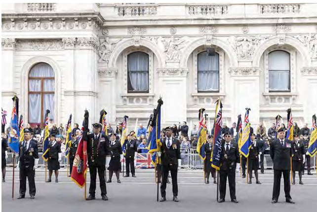
Contingent of Royal British Legion Standards at the Queen's funeral

It has been an honour and a privilege to have Queen Elizabeth II as our Patron since 1952. Representing all Members, 72 RBL Standard Bearers from across the UK, as well as Parade Marshals took part in the funeral procession, paying tribute to our late Monarch. Here is what some of these Standard Bearers said ahead of the Queen's funeral.