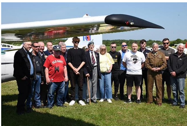
Teenage pilot takes to the skies with 100 veterans