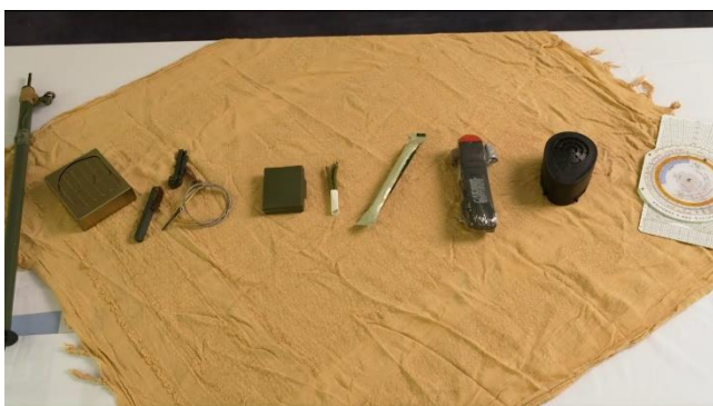
Armed Forces Week

Our thoughts are with his family and friends at this difficult time.