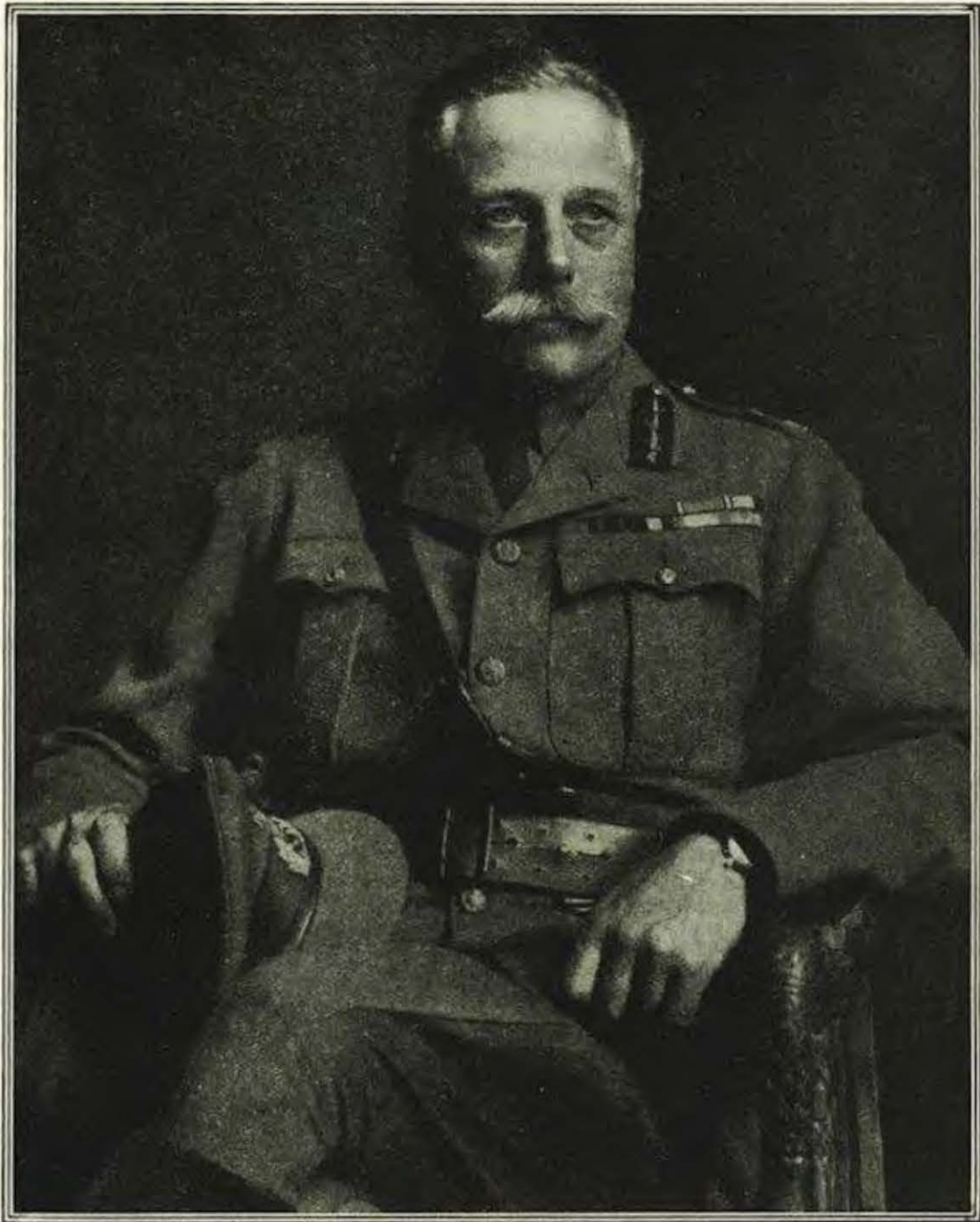
FIELD-MARSHAL EARL HAIG, K.T., G.C.B., O.M., G.C.V.O., K.C.I.E. (PRESIDENT OF THE BRITISH LEGION)