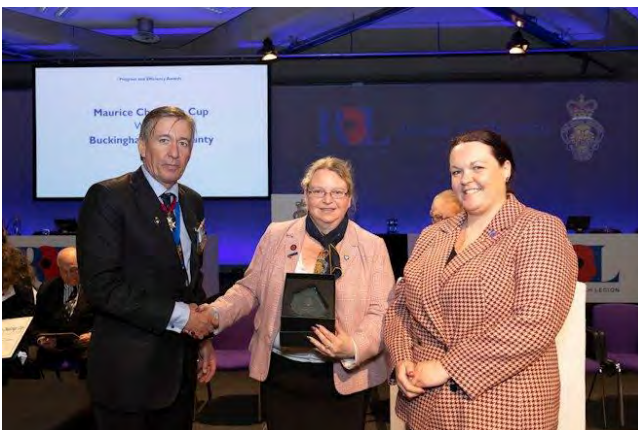
The Buckinghamshire County on winning the Maurice Cup

The Buckinghamshire County received the Maurice Cup at this year's conference as the County/District/Section that made the most progress during the year. With 33 Branches the County saw a 34% increase in membership and added 885 new Members, while the Committee also encouraged more Branches to sign up to Branch Community Support especially during the pandemic.