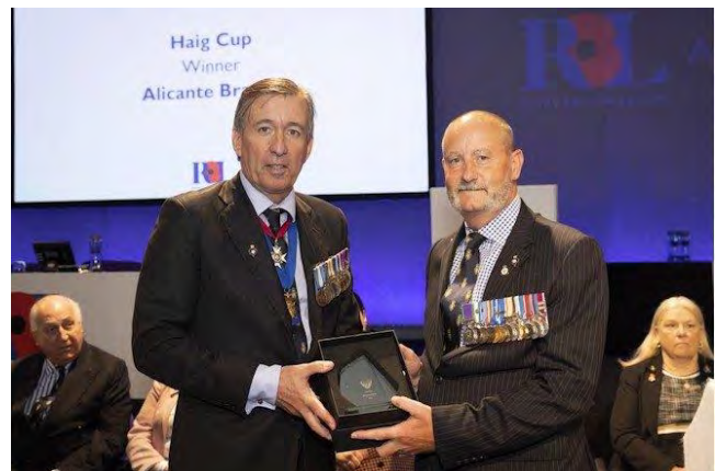
The Alicante Branch was awarded the Haig Cup at Conference

The Buckinghamshire County received the Maurice Cup at this year's conference as the County/District/Section that made the most progress during the year. With 33 Branches the County saw a 34% increase in membership and added 885 new Members, while the Committee also encouraged more Branches to sign up to Branch Community Support especially during the pandemic.