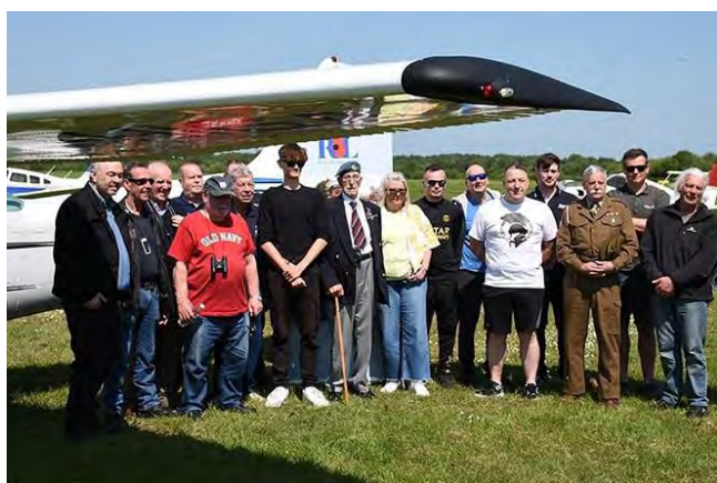
Teenage pilot takes to the skies with 100 veterans