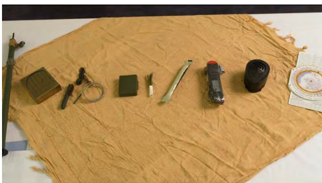
Armed Forces Week

Our thoughts are with his family and friends at this difficult time.