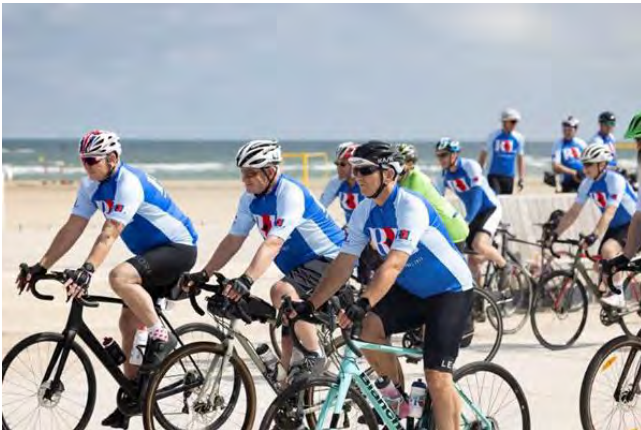
Pedal Normandy beaches - last chance to sign up

Join the ride to explore Normandy's wartime history. We have a few spaces left for the event taking place between 12th and 16th July. Over three days we'll cycle through Normandy, marking the 80th Anniversary of the D-Day landings and remembering the sacrifices made by all those who fought in both World Wars. Use this exclusive code Normandy50 to get £50 off the entry fee!