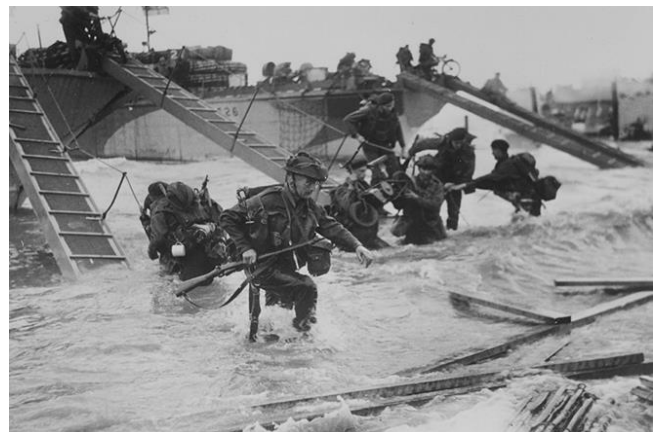
Remembering D-Day and the Battle of Normandy