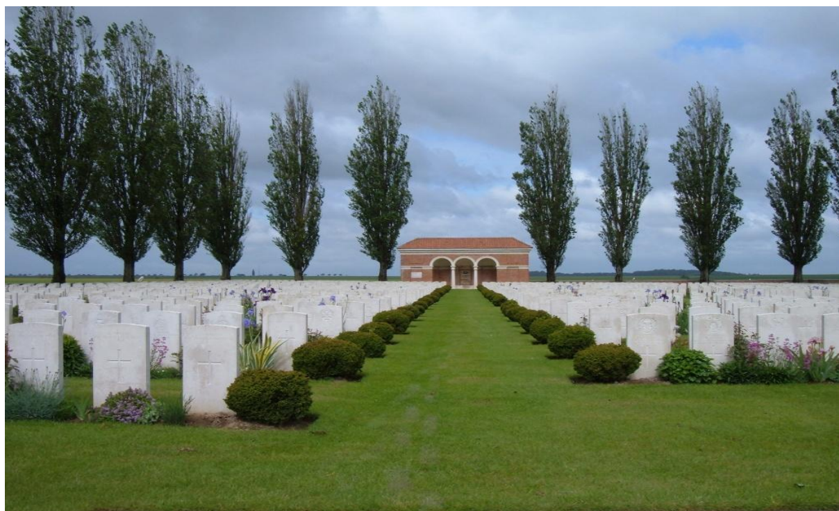
Honourable Artillery Company Cemetery, Ecoust-St. Mein