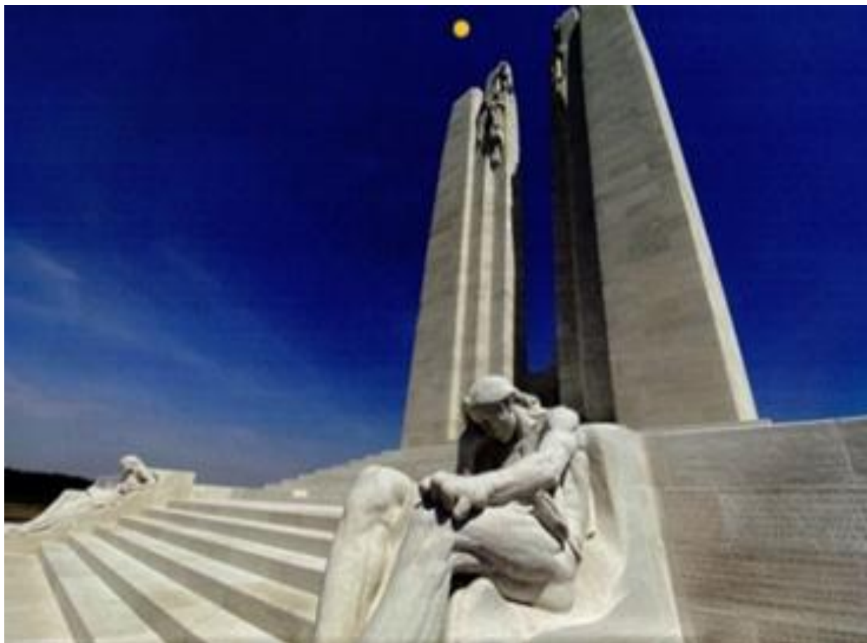
The Vimy Memorial

She also informed us regarding the CWGC responsibility for significant war memorials. One example was the Vimy Memorial, There are 20 symbolic figures on this monument including those that represent Justice, Truth, Knowledge, Gallantry, Sympathy with Peace at the top.