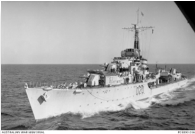
HMS Comus, a 'Co' class destroyer

And now today, we've saved the ship, and we're limping to dry dock. Today we're doing mundane things to relieve the numbing shock.