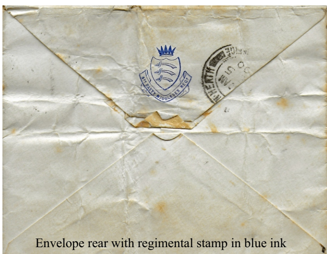
Envelope rear with regimental stamp in blue ink

3rd Middlesex Regt during the Anglo Boer War 1899 - 1902. He accepted the Shilling and posted it home in the envelope to himself as a keepsake of the practice. DW