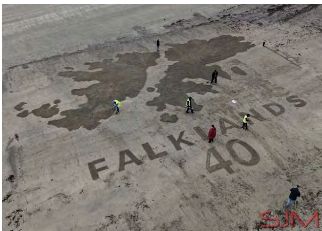
The Looe Branch commissioned a sand drawing for Falklands 40

To commemorate the 40th anniversary of the Falklands War, Looe Branch Members commissioned a sand drawing, that was created on East Looe Beach. Local residents, Veterans and Members of the Branch gathered on the day to see the sand drawn tribute and remember the service and sacrifice of those who served in the Falklands.