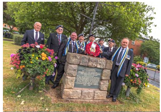
The Stafford Branch held a service to mark 40 years since the Falklands War

To commemorate the 40th anniversary of the Falklands War, Looe Branch Members commissioned a sand drawing, that was created on East Looe Beach. Local residents, Veterans and Members of the Branch gathered on the day to see the sand drawn tribute and remember the service and sacrifice of those who served in the Falklands.