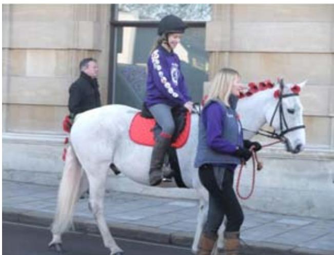
Trigger the pony marching in the Teddington Remembrance Parade 2012.