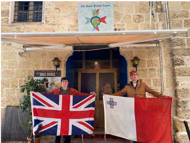
Two young Members raised funds to support the Poppy Appeal in Malta