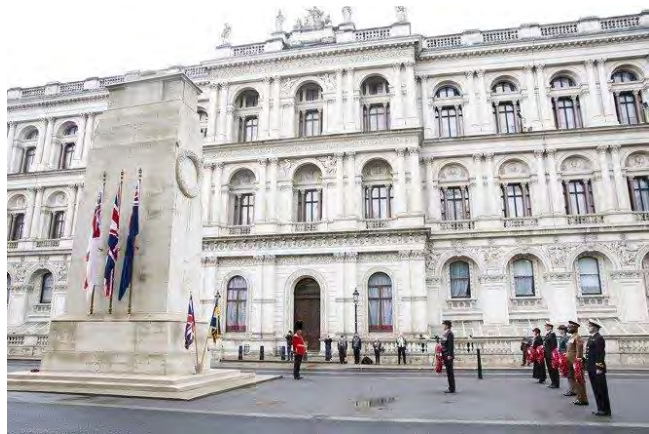
This Remembrance Sunday we remember the service and sacrifice of all those who served to