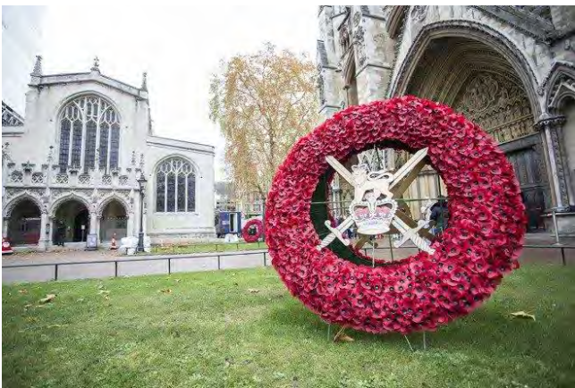
This October a service of celebration and thanksgiving will take place at Westminster