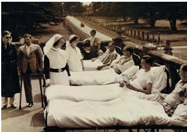
Helping sick and wounded veterans after WWI and beyond

The RBL has a long history of helping veterans back into work and providing grants to set up their business. We want to go one step further by establishing a 'Veterans' Market' within the Poppy Shop, aiming to support veterans grow their businesses, by guiding them through initial business processes and feature exclusive products only available at the Poppy Shop. Keep an eye out for more information and the launch in mid-September.