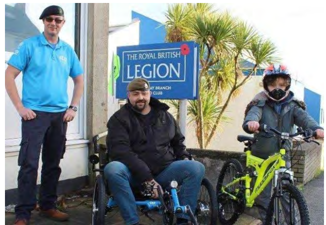
Helping a veteran and his family get back on their feet

Over 55,000 men returned from WWI suffering from Tuberculosis (TB). Back then, the British Legion created a hospital and village to