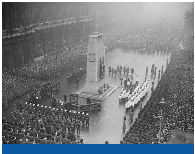
Marking the Royal British Legion's centenary

In 1921 veterans from four organisations, came together to lay wreaths at the Cenotaph as a symbol of unity and form the British Legion. On 15 May a special event will take place at the Cenotaph, recreating this moment from 100 years ago. Watch the live streamed event from 8.55 am on our Facebook page.