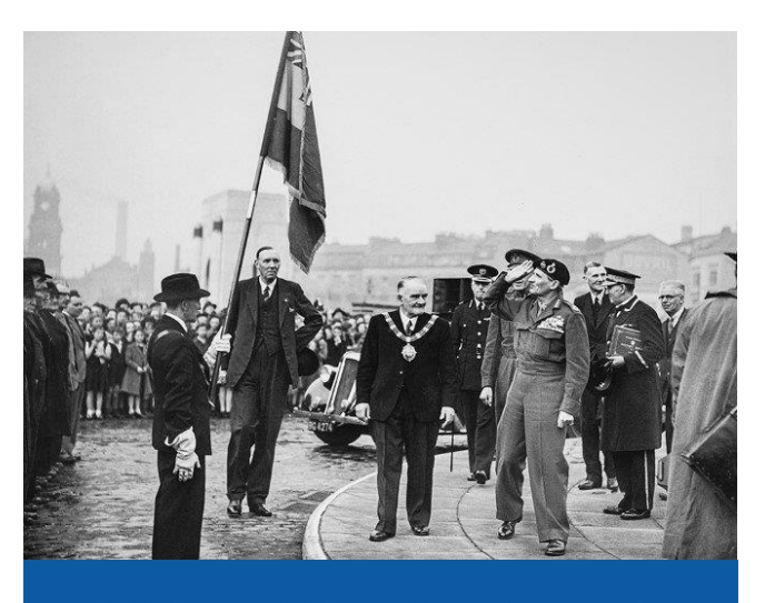
RBL100 activities taking place on 15 May 2021

Keep an eye on our social media for photos and videos of centenary activities, including a Westminster Collection RBL commemorative coin used in the FA Cup final coin toss and messages of celebration from serving personnel and the Royal Family. Share your activities using the hashtag #RBL100.