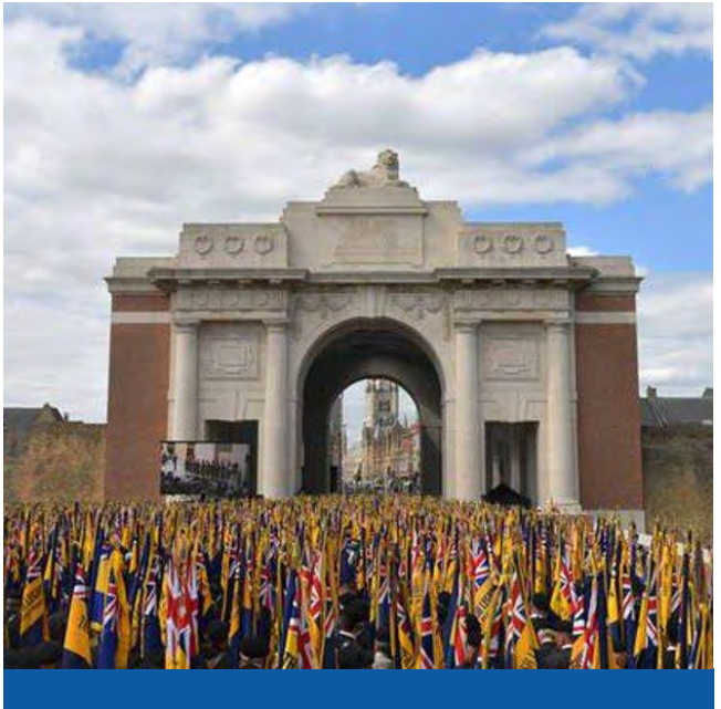
100 years of Membership

Back in 1921, Members started forming local Branches to help those in urgent need of support and in 1928 they organised the Great Pilgrimage to remember those who made the ultimate sacrifice during WWI. Today's Members are still providing vital support and are holding Remembrance events and will continue to be at the heart of our work for generations to come.