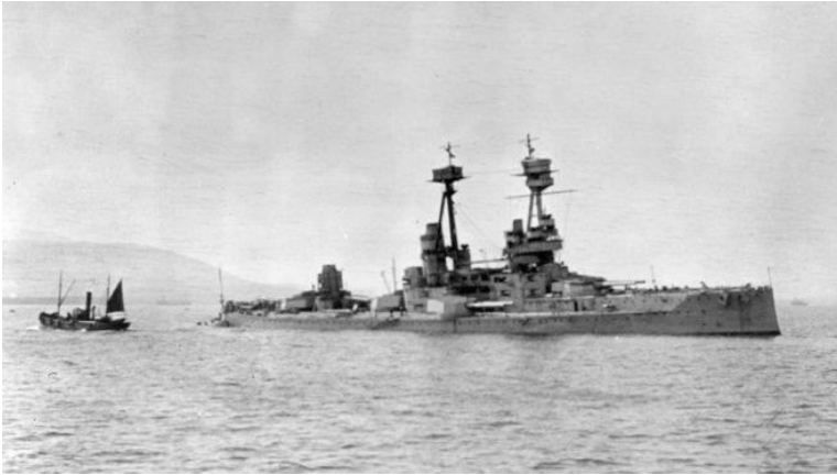
H.M.S Vanguard 9 th July 1917.

William Jnr died at Scapa Flow, but not in the heat of battle. Instead, one of the two magazines on the ship exploded, probably due to the heat from an unnoticed fire in the stokehold (coal store). These fires were quite common, in fact one theory is that such a fire contributed to the sinking of the Titanic due to the heat generated weakening the structure sufficiently for it to collapse when it hit the iceberg