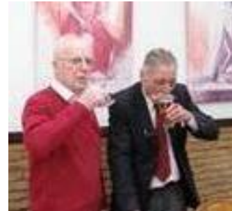
Members enjoying lunch, friendship and a pint at Les Brasseries Rustiques

The “Red Coats” Society, 145 Bld de Smet Naeyer, 1090 Brussels: