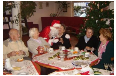
Wednesday Club Christmas Lunch.

Volunteers to help with transport and club activities are welcome, especially volunteer drivers. Contact: vols@the-wednesday-club.org