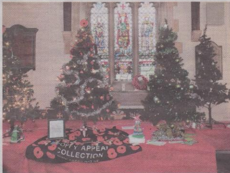
The Poppy Tree by the Royal British Legion and the Macmillan Tree by Macmillan Cancer Support.