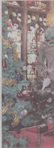
An innovating decorate