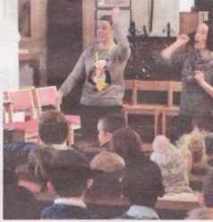
Adding some mov