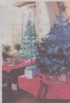
A beautiful array of cold Warminster Diabetes Support Beautiful Blossom by the Together by Warminster Co