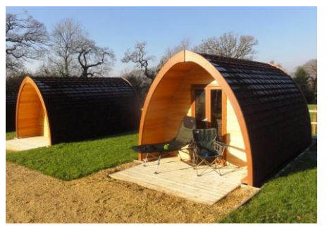
The Brockenhurst 'Poppy Pods'

The formal opening of the new facilities will take place in the spring in time for the Tile Barn Centre's new season. The Community Hub will be used by the Branch on ANZAC Sunday for hosting visitors and will also support the major commemoration event to mark the Battle of the Somme centenary at the end of June.