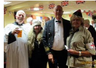
Milford on Sea members : remembering the horrors of World War II, celebrating the victory in costume of the period and raising £350 for the Poppy Appeal.