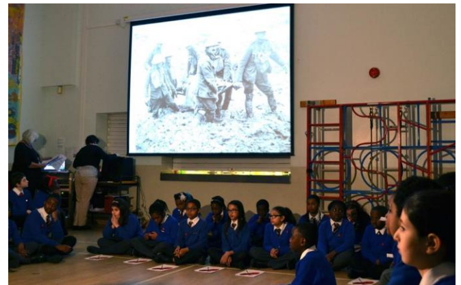
Authentic Images from WW1 were projected onto a big screen

After a moving Act of Remembrance led by The Royal British Legion, the evening ended with a sing-along of wartime songs which literally had some members of the audience dancing in the aisles.