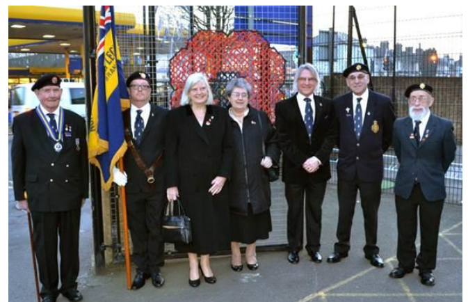
Leytonstone Branch with staff members

This coordinated approach just goes to show how local Branches can engage with schools as custodians of Remembrance and perpetuate to our younger generation the importance of honouring those that have lost their lives in the name of Queen and Country.