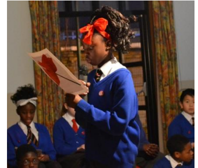
Pupil reading poetry

Donations for refreshments and RBL souvenirs raised £120 for The Royal British Legion.