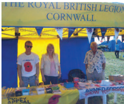
Pictured: Members of Camborne RBL

Camborne Branch were able to sell a number of RBL items and to hand out many flags, balloons, pens, stickers and other trinkets to the public and children, many of whom will now have Legion items around their homes reminding them of the RBL. This event continues to be a great public relations exercise .