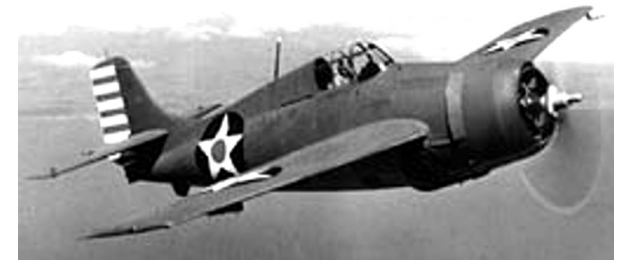
Grumman F4F Wildcat

Laying aside all thoughts of personal safety, he dived into the formation of Japanese planes. Wing-