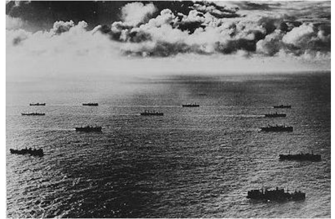
Atlantic convoy 1942

http://www.royalnavy.mod.uk/Battle-of-the-Atlantic