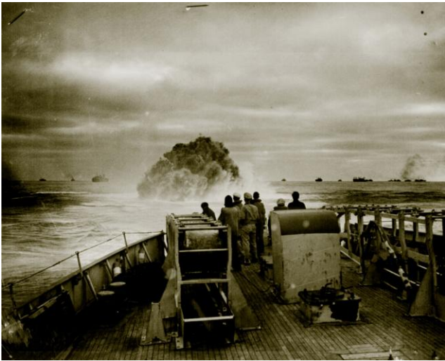
USCGC Spencer sinks U175 with depth charges in April 1943

The Battle of the Atlantic was the longest continuous military campaign of WWII and resulted in the loss of some 30-40,000 Merchant Navy personnel and around 5000 ships. The turning point in the campaign for the Allies was May 1943 when German submarine losses became unsustainable. To mark the 70 th anniversary of this historic event, the Royal Navy, supported by representatives from the Merchant Navy and other maritime organisations, is holding a series of events across the UK during May 2013.