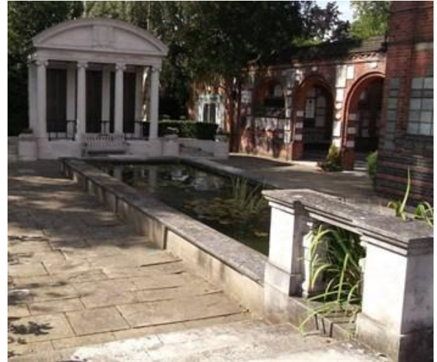
Golders Green Crematorium