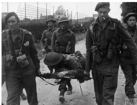
4 Commando, 1st Special Service Brigade, advance into Ouistreham, Sword area, 6 June 1944.