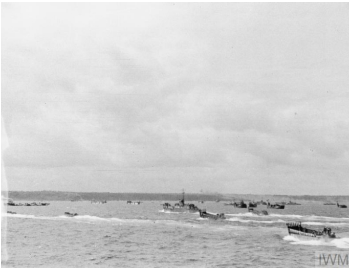
First US assault waves head towards the beach in Dog sector, Omaha area, 6 June 1944.

telescopic mast equipped with navigation lights and radio beacon to guide British and Canadian landing craft to the beaches.