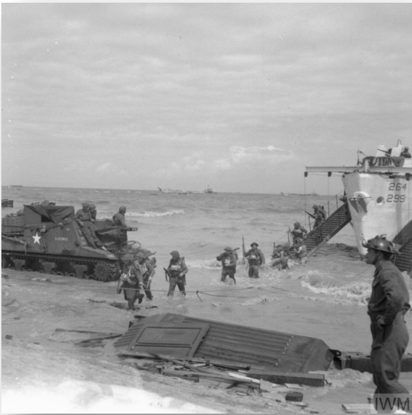
50th Div, Gold area, 6 June 1944. Sexton 25pdr gun of 147th Fd Regt (Essex Yeomanry), 56th Inf Bde.

Regt capture Hermanville but cannot advance without tank support from the Staffordshire Yeomanry in order to move on. The casualties on Utah amount to 2,000 dead.