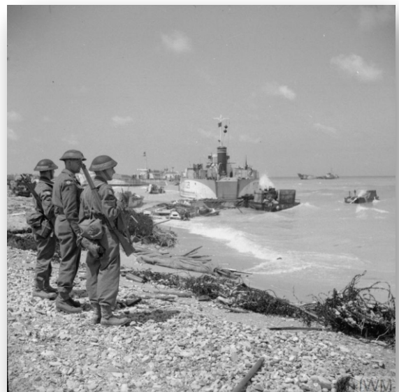
Queen beach, Sword Area 7 June 1944