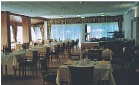
Alderton House Dining Room

Generally referrals will come through the County Office for the local volunteers to contact the applicant and arrange a visit. Final decisions and any awards are made in Leicester. The County total Welfare Expenditure was £183,773, with Cases 296 completed. This year several requests came as a result of the Leicestershire County Council's First Contact initiative - a signposting service of which The Royal British Legion is a Partner. It is also important that members keep the welfare team informed of any need.