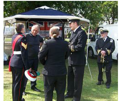
Sea Cadets Stand

All three Cadet units took part in the Armed Forces Day Event and this year were joined by a Sea Cadets unit from Hinkley. They were involved or had their own static stands and displays. In the arena there were interesting examples of skills acquired through training and practice like the Field Gun exercise by the