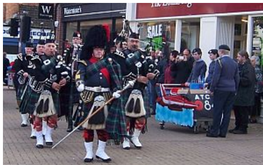
Appeal Launch - Pipers & ATC "plane" ready for take-off

Our contribution to the Legion's aim to raise £90 million in its 90th Anniversary Year, has been the excellent total that missed our target of £30,000 by only a few pounds, is over 30% more than last year and nearly 6% of the County total of £525,161 which is up by about 10%. On the basis of the 2001 census, our total equates to a nominal 95p per head of the population of our collecting area. It is very gratifying in view of the prevailing economic climate, and the difficulty in recruiting volunteers especially for street collections. The lack of members willing to act as collectors is very disappointing, especially in view of the increase in branch membership of 23% in the last five years.