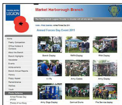
Screen shot of Armed Forces Day Photo Gallery

The new branch web-site launched last year as www.britishlegion.org.uk/branches/market-harborough has been progressively developed to promote the branch and to describe fully its past, present and known future activities. It makes generous use of photographs, both singly and as sets (galleries) covering specific events.. Current and all previous issues of In Touch are now accessible, including those of all the first 14 years, although the archive web-site www.in-touch.ukvet.net is still live. The new site is also an archive and already contains all issues of the Branch Annual Report, the previous year's "Recent Events" and a project report. It also has a Search facility.