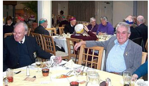
That was a good Christmas lunch!!

Regular monthly luncheons have continued at The Angel Hotel but the increase in numbers attending reported last year has not been maintained. The January belated Christmas Luncheon was again shared with our RAFA and RNA friends. There was no Autumn Dinner but the Anniversary Dinner in March was held. As in previous years, we were joined by members of two other branches and of RAFA, RNA and the Cadets. Music for dancing was re-established but using (free) Chairman-operated equipment instead of having a paid DJ. Funds were raised from an auction as well as the usual Raffle.