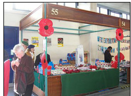
Poppy Appeal Stall in the Market Hall

Fund raising activities like the Coffee Morning at the Harborough Theatre and the Annual Remembrance Concert again publicised the Appeal as well as contributing useful funds. The same is true of the stall in the Market Hall which acts as a "sales" and information point and as a "control centre" for the Street Collectors on the days the hall is open. Sainsbury had adopted the Poppy Appeal as their nominated Charity in Leicestershire for the year so this gave added publicity as well as a valuable donation. A publicised "mini forum" at the Angel Hotel gave publicity to the Appeal but did little to recruit new collectors.