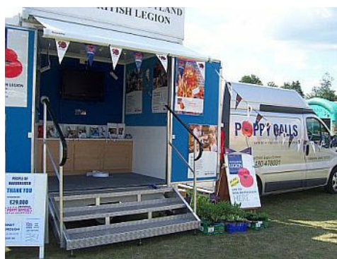
Static Display at the Carnival

It is now taken for granted that the Branch will take a prominent part in the local community calendar. The Branch organises the Remembrance Parade and Services, creates the Field of Remembrance, arranges a Remembrance Concert with the Harborough Band, has a Poppy Stall in the Market Hall and our usual presence at the Town Carnival this year included a Float in the