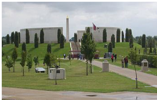
The impressive Armed Forces Memorial

A group of members attended Festival of Remembrance at de Montfort Hall arranged and taken by a social team member. A proposed outing to Newmarket for the Poppy Race Day did not attract sufficient interest for a coach to be hired but our Standard Bearer and her family did attend and she took part in the Parade - the sole representative from the County.