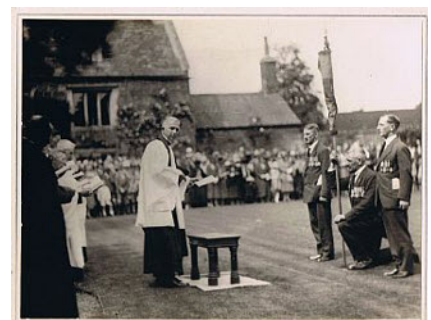
Our oldest archive -Standard Dedication in 1921 at Langton Branch which was later absorbed into ours.

The County Records Office project "90 Years of the Legion in Leicestershire and Rutland" involved us in sorting and recording what Branch records exist and in preparing a visual display for their exhibition. It has also emphasised how much of our history has been lost and the importance of preserving information for the future. Now the Cabin provides secure storage for paper documents, a scrapbook of past and new material and some artefacts. The web-site and digital storage media also provide long-term security. Some material has been lodged with the Records Office.