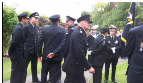
Fire brigade, Police & others before the Drum-head Service

This year was the 90th Anniversary of the unveiling of the War Memorial on The Square and the Branch led a commemoration with a Drum-head Service which included extracts from speeches made on 25th September 1921 still relevant today.