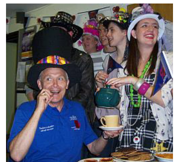
Mad Hatter & Chairman!

At Coffee Mornings cadets come into close contact with members of the public who appreciate the courtesy and helpfulness of those from the ACF on kitchen duty or the ATC on the Tombola or Raffle stalls.