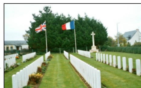
Escoublac-Ilaboule_war_cemetery from a Bordeaux Branch story

The last Annual Report explained that an e-mail was sent each month to a number of branches and interested individuals, advising that the latest issue of In Touch was on-line (on www.in-touch.ukvet.net ). This mailing list has been expanded to include all branches for which e-mail contacts could be found, and now numbers about 120. Many recipients have commended the idea of greater inter-branch communication and would welcome some means of sharing the wealth of experience, ideas and interesting information that branches possess. Market Harborough will willingly participate in developing a suitable system.