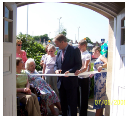
Edward Garnier QC, MP opens CVS/ Volunteer Bureau offices