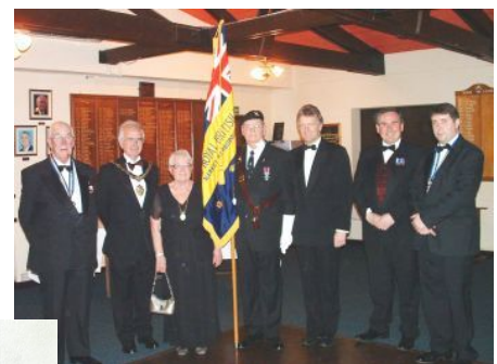
83rd Anniversary Dinner