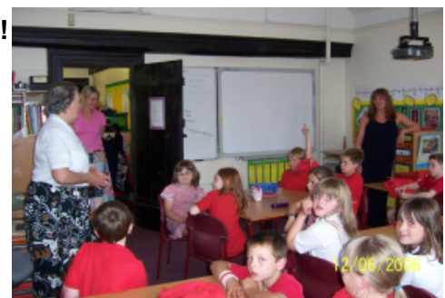
"What I did in the War" A talk to local primary school