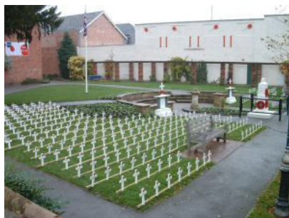
Garden of Remembrance 6th Year