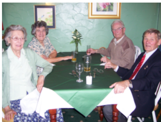
Lunch at the Shoulder of Mutton, Foxton

Another busy year for the Social and Fundraising Team resulted in a full programme of activities that were both enjoyable and profitable. The monthly luncheons which had to be discontinued