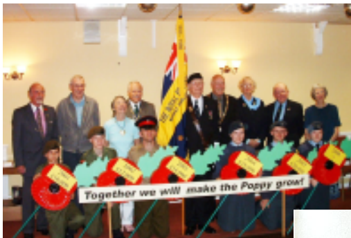
Poppy Appeal Awards Event