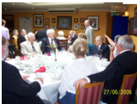
Veterans' Day Lunch with RNA & RAFA