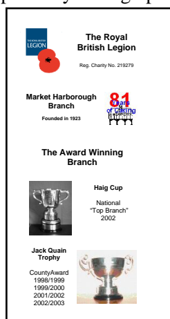
Cover page of tri-fold Branch Leaflet

As shown on Page 5 many Branch activities keep us in the public eye. Some specific events call for direct publicity through press releases,