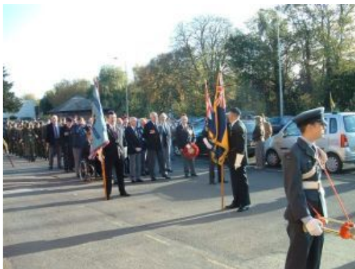
Remembrance Day Parade forms up

The Branch is also regarded as the local authority on military and ex-Service matters by the Library, Museum, local Council, schools and individual members of the public who from time to time seek our opinion, advice and help.