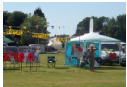
Market Harbourough Carnival A very windy day!