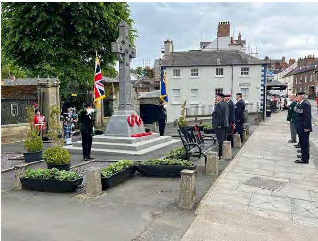
The Royal Hillsborough Branch, a new Branch finding its old roots

The Royal Hillsborough Branch is one of the RBL's newest Branches and re-opened in September 2021. Over 60 Members have joined since formation and events have been organised for the community including a dedication service for the new Standard that was well attended by the public and supported by other Branches and associations who paraded their Standards through the village.