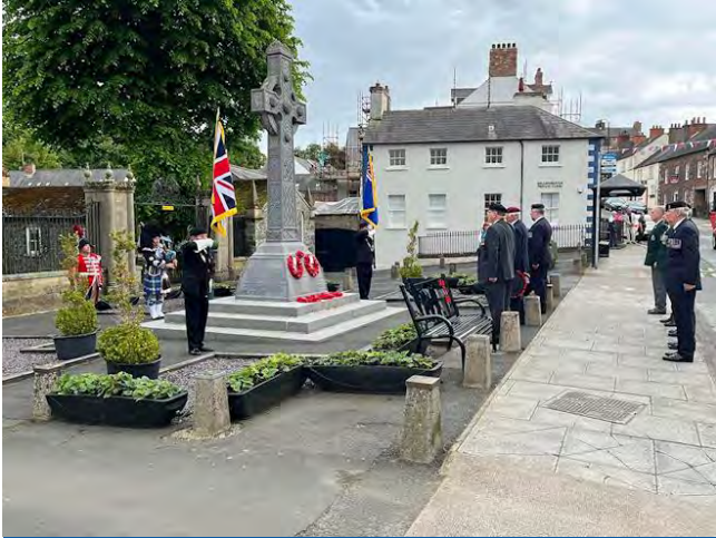
The Royal Hillsborough Branch, a new Branch finding its old roots

The Royal Hillsborough Branch is one of the RBL's newest Branches and re-opened in September 2021. Over 60 Members have joined since formation and events have been organised for the community including a dedication service for the new Standard that was well attended by the public and supported by other Branches and associations who paraded their Standards through the village.