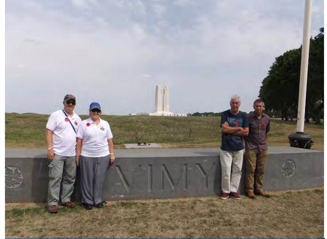
9 Members of the same family across 5 generations have joined the RBL