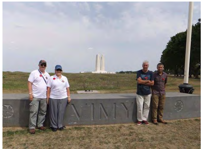
9 Members of the same family across 5 generations have joined the RBL

The Royal Hillsborough Branch is one of the RBL's newest Branches and re-opened in September 2021. Over 60 Members have joined since formation and events have been organised for the community including a dedication service for the new Standard that was well attended by the public and supported by other Branches and associations who paraded their Standards through the village.