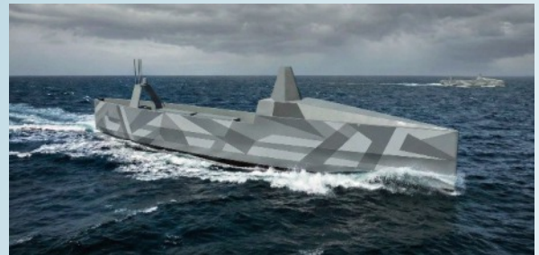
Future uncrewed surface combatant?

The UK armed forces have reached their nadir when Europe and NATO face the biggest threat since the Cold War, and at