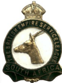
British Empire Service League. South Africa. Raised in 1921