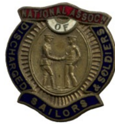
National Association of Discharged Soldiers and Sailors. Raised in 1917