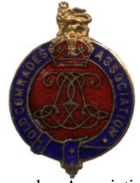
Old Comrades Association. Raised by individual regiments at different times. The first was raised directly after the First World War.