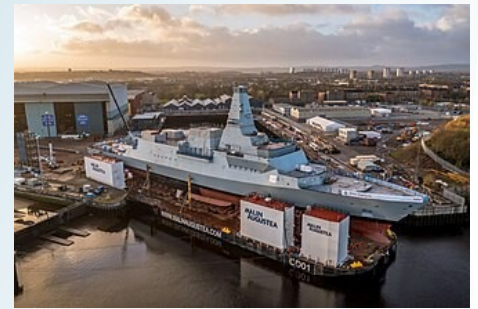
HMS Glasgow Type 26

Based on the 'rule of thirds' (⅓ in refit; ⅓ in routine maintenance and preparing for or returning from operations; and ⅓ operational), even 19 escorts will give the Royal Navy only 2 Type 45s, up to 3 Type 26s and maybe 2 Type 31s ready for immediate operations. To form a Carrier Strike Group, a Queen Elizabeth Class aircraft carrier requires at least 2 destroyers and 2 ASW frigates (currently we rely on NATO allies) plus an attack submarine and logistics support. These ships will require crews, but there's an aspiration to augment their fighting power with uncrewed platforms. But, just in terms of crewed escorts, "We need 25 just to survive". Tell your MP or chain yourselves to the railings outside Parliament armed with this slogan! Silver Jubilee Fleet Review 1977 From a peak of some 2,000 assorted vessels and nearly a million men and women in 1945, the Royal Navy has been in steady decline. Bankrupted by two world wars, Britain was faced with the task of dismantling an empire that once ruled a quarter of the world and developing armed forces more appropriate to a small though influential island off the coast of mainland Europe. Although worldwide commercial interests and remaining overseas obligations/treaties still favoured a maritime strategy, the need for ground and air forces to garrison a defeated Germany and counter the emerging threat from the USSR remained. The