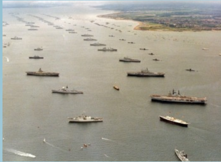
Silver Jubilee Fleet Review 1977

fixed wing aircraft carriers and withdraw British forces from 'East of Suez'. This left the Royal Navy with three large aircraft carriers of World War II vintage converted to operate modern fast jets and four light fleet carriers, two of which were converted to commando ships. The last fixed wing carrier (HMS Ark Royal) paid off in 1978 and the Royal Navy focussed on providing anti-submarine forces to support the USN Striking Fleet in the North Atlantic. Fortuitously the idea for building three 'through-deck cruisers' was conceived to operate Sea King ASW helicopters and, eventually, a small number of Short Take Off and Vertical Landing (STOVL) Sea Harriers