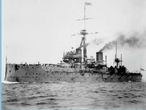
HMS Dreadnought 1906

Admiral Sir John Fisher was appointed First Sea Lord on 2nd October 1904 and immediately set about modernising the Royal Navy. One of his aims was development of fast all big-gun battleships. The first of these was laid down on 2nd October 1905 and commissioned as HMS Dreadnought on 2nd December 1906.