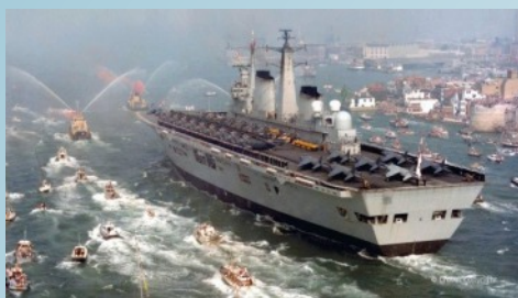
HMS Invincible returning to Portsmouth from the South Atlantic 1982

were ordered for air defence. To help cover the gap while the three Invincible class 'through deck cruisers' (aka aircraft carriers!) were under construction, the light fleet carriers HMS Hermes and HMS Bulwark (ex-commando ship) were converted to fulfil the role with Hermes also able to operate Sea Harriers. At about the same time it was resolved to maintain an escort force of about 60 destroyers and frigates. Having blamed Wilson's Labour government for loss of the four aircraft carriers, the Conservative's 1981 Defence White Paper (aka the Nott Review) proposed selling HMS Invincible to Australia, scrapping or selling remaining amphibious ships, reducing the number of escorts to about 55 and refocussing the fleet offensive capability on attack submarines. Crucially, the ice patrol vessel HMS Endurance was also to be withdrawn from service which may have been a catalyst for the Argentine Junta to invade South Georgia and the Falkland Islands in 1982. Despite being totally unprepared, the Royal Navy was able to assemble a task force within 48 hours. This comprised the carriers HMS Invincible - returning to Portsmouth from the South Atlantic 1982