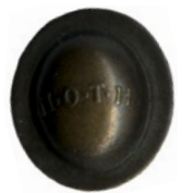
Memorable Order of the Tin Hat. Raised in 1927 by Australian born Charles Evendon.