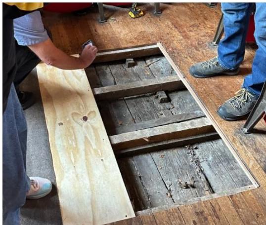
The Shakespearian Flooring

We then walked down to the Sr George Guildhall with its famous original flooring reputedly to have been trodden on by no less than William Shakespeare himself in the 1590s. Seeing the various doors installed down the sides of the Guildhall at various levels resulting from the increasing floor levels over the years was amazing.