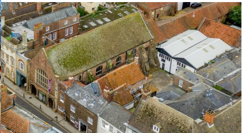
Aerial view of the St George Guildhall