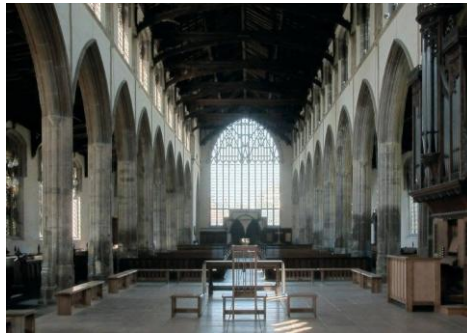
Nave facing West