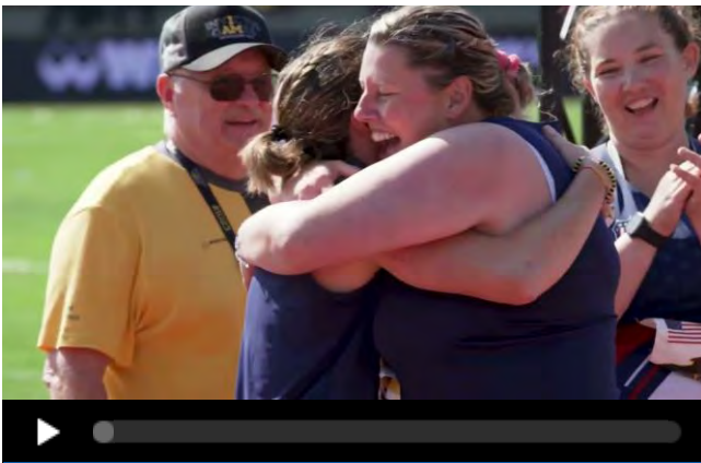
Invictus Games Dusseldorf 2023