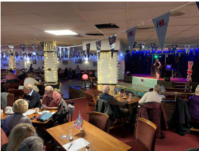
Worcester Park Branch held an event for HM The Queen's Platinum Jubilee and recruited new Members

The Worcester Park Branch celebrated HM The Queen's Platinum Jubilee with an event at the local RBL Club. The event was well attended by Members and Veterans and was open to the local community with 4 new Members joining on the day. Members also set up their new RBL branded pop up tent outside