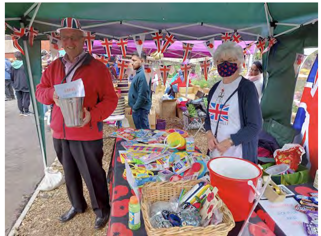
Malden & Coombe Kingston on Thames Branch marked the Jubilee alongside their community

The Worcester Park Branch celebrated HM The Queen's Platinum Jubilee with an event at the local RBL Club. The event was well attended by Members and Veterans and was open to the local community with 4 new Members joining on the day. Members also set up their new RBL branded pop up tent outside