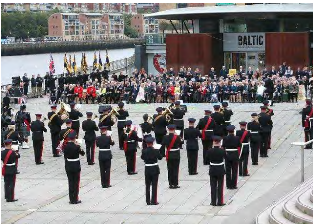
The Northumbria County marked RBL100 with a special event and film