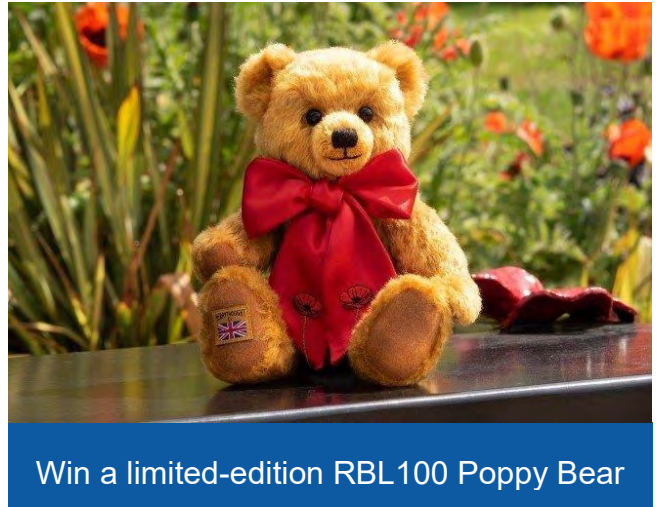
Win a limited-edition RBL100 Poppy Bear

To mark the RBL's centenary, our partners Merrythought, the UK's oldest-remaining soft toy manufacturer, are giving you the chance to win a personalised (name will be embroidered on the paw) limited-edition handmade Poppy Bear (RRP £145). Click the button below to enter the draw before 1 December or if you want to buy a bear now please visit Merrythought's website . £15 from every sale will be donated to the RBL.