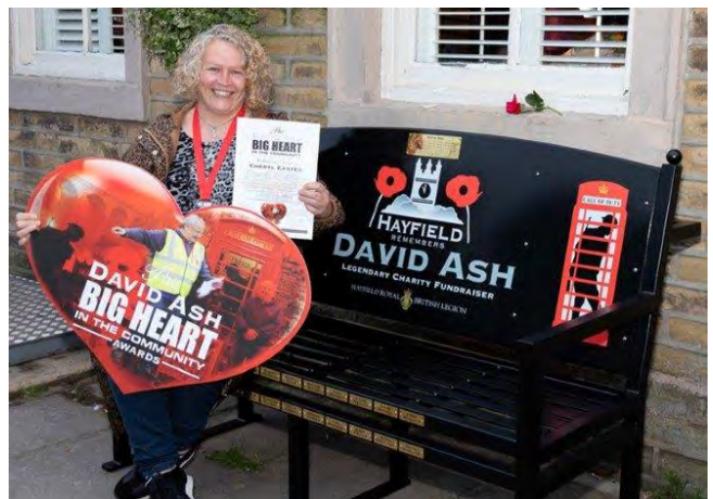
Raising funds in memory of a long serving Member