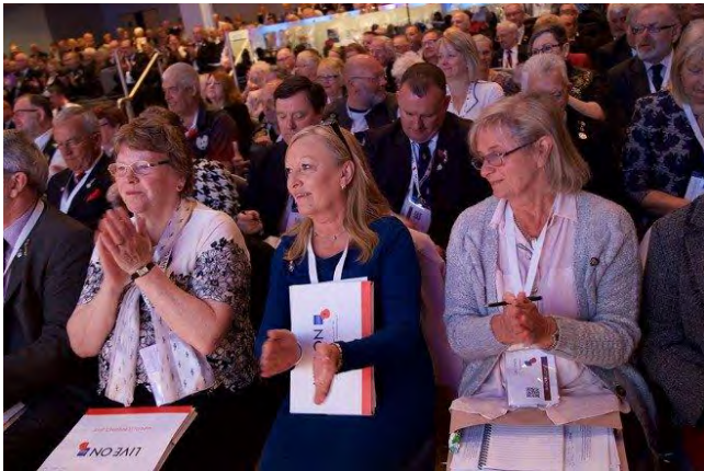
RBL101 - Annual Conference 2022 in London from 13-15 May

close our eyes and contemplate the selfless work of the Armed Forces, showing why the RBL's support is so vital. The Close Your Eyes advert will launch across primetime TV, social media, digital advertising and will be expanded online with video stories that highlight the dedication of the Armed Forces community.