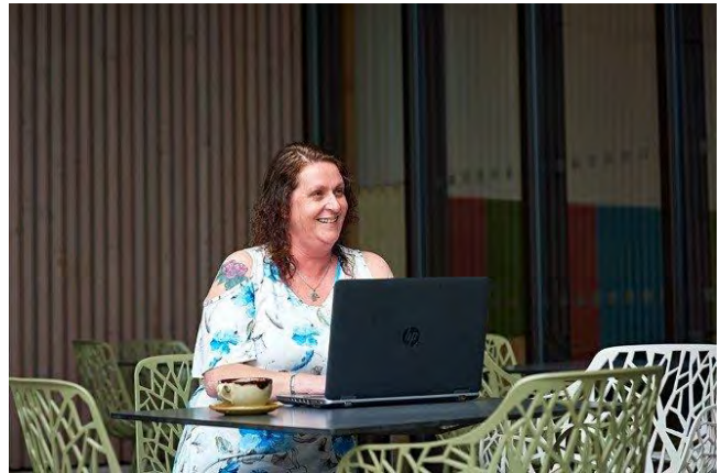
Attend our town hall to learn about the changes in the Trustee election process

If you'd like to get involved in the charity's governance, you can join our virtual townhall event on 14 October at 7 pm to hear more about the work of the Board of Trustees, the changes in the Trustee election process and how you can submit your nomination. Click the button below to register. Prior to the event you'll receive an email with instructions on how to join on the day.