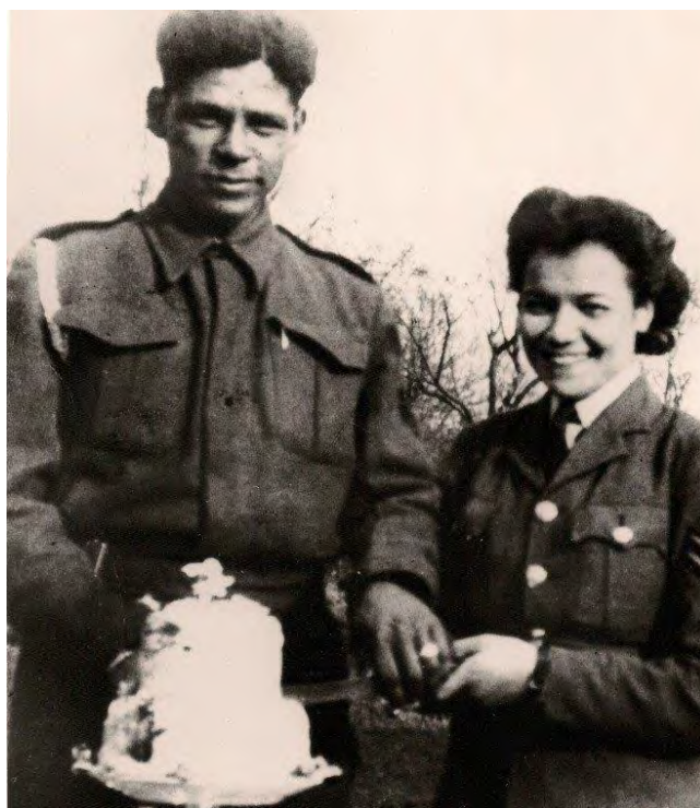
Black History Month

As Covid-19 restrictions ease, our collectors are back out in their communities to raise vital