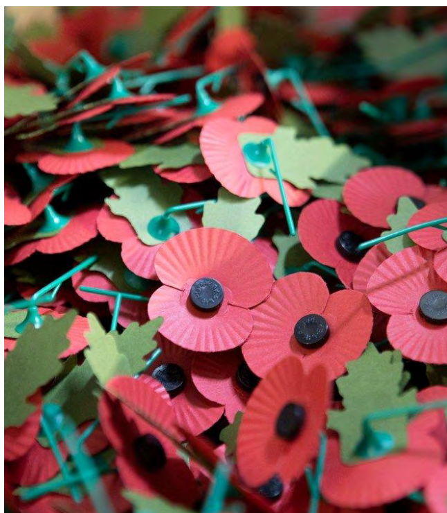
Poppy Appeal 2021

As Covid-19 restrictions ease, our collectors are back out in their communities to raise vital