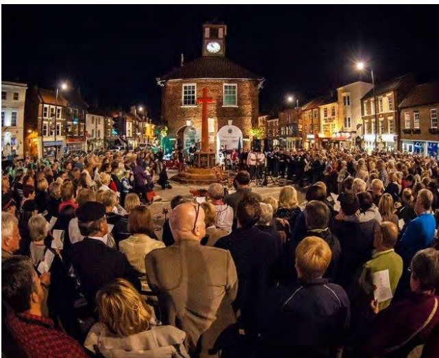
Stockton on Tees Branch – Helping the community for 100 years

The Stockton on Tees Branch was formed in 1921 and throughout the last 100 years has supported and has received support from generations of people in some cases members of the same family. Members today continue to help their community by raising funds with local organisations assisting them while they also provided support to those vulnerable during the pandemic and organised a school competition to celebrate RBL100.