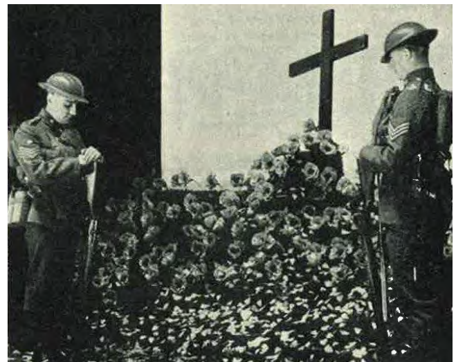
Jersey RBL – An overseas Branch formed in 1922

The Stockton on Tees Branch was formed in 1921 and throughout the last 100 years has supported and has received support from generations of people in some cases members of the same family. Members today continue to help their community by raising funds with local organisations assisting them while they also provided support to those vulnerable during the pandemic and organised a school competition to celebrate RBL100.