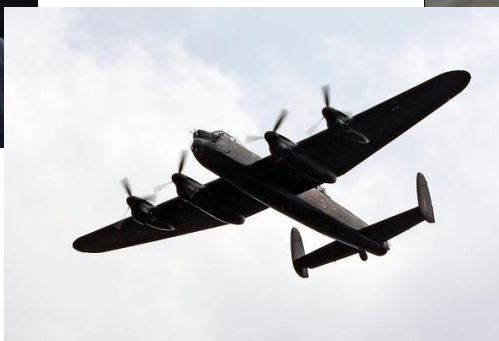
The BBMF Lancaster over the airfield