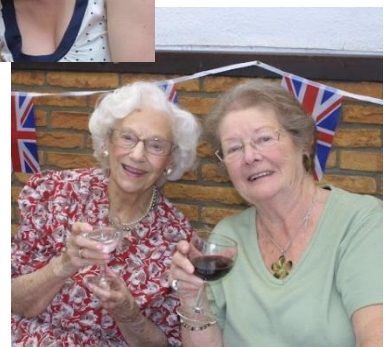
A right royal celebration