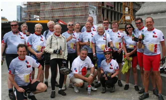
The cyclists enjoying a well earned drink