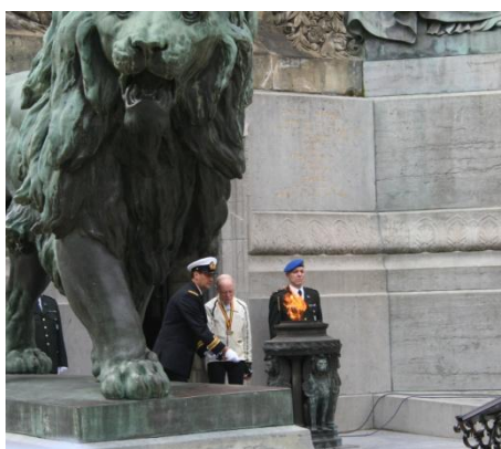
Re-kindling the eternal flame

On one of the rare sunny afternoons in June, there was a ceremony at the tomb of the Unknown Soldiers in Brussels to celebrate the arrival of riders on the "Bike to Brussels" organised by the Royal British Legion. More than 30 bike riders, of all ages and from all backgrounds, arrived in Brussels after a 200km cycle ride from Calais via Ieper. The sun shone and the ride was a great success, raising funds for the Legion's valuable work.