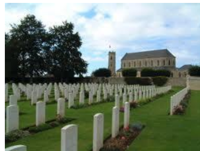
Ranville War Cemetery

François Hollande has become the first French President ever to visit the graves of thousands of British soldiers who died liberating France on D-Day. He visited the Ranville War Cemetery near Caen, Normandy, to mark the 68 th anniversary of the famous invasion.