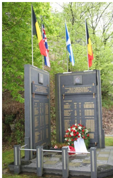
51st Highland Division Memorial