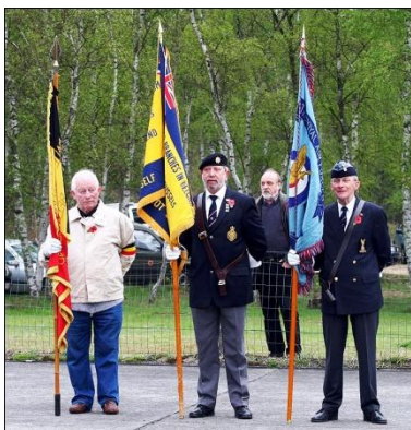
Standard Bearers at the ceremony