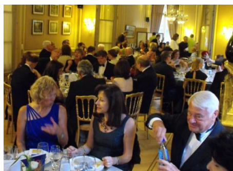
Guests at the ball

Join us on Facebook - Royal British Legion Brussels