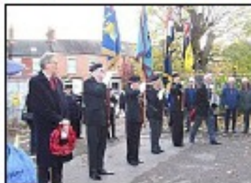
Wreath laying ceremony at the Cottage Hospital - 11 November

Another successful and popular Poetry Reading - 13 September