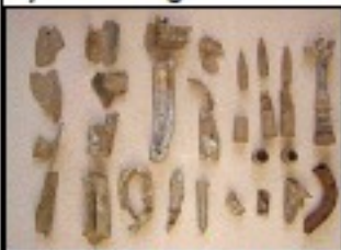
Some of what was found after cleaning

The initial search was at the edge of the field in which the pylon stood and several finds were of heavy bits of probably agricultural material. Moving into the next field David got many signals and the three concentrated the search there and many bits were dug up, all quite small and covered in soil. The only things which were recognisable were of bullets and broken cartridge cases. By measuring the location relative to