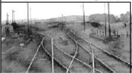
Welham sidings in 1960