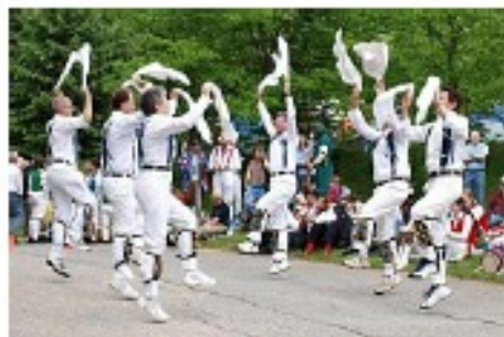
Morris Dancing May Day tradition