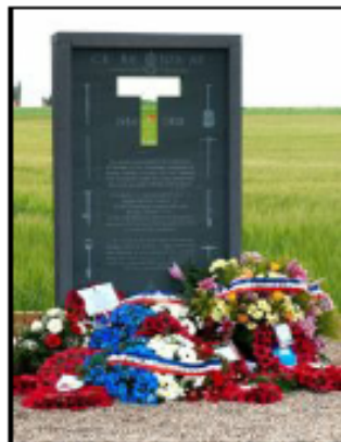
Photo taken at the unveiling ceremony

With William Hackett's courage exemplifying the Tunnellers' work, this memorial stands at Givenchy in