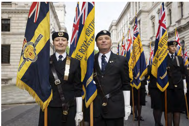
Annual Conference Torquay 19 - 21 May 2023

An annual highlight of Conference is the Parade of massed Standards. It is the public face of Conference, when Standard Bearers from Legion Branches, Counties and Districts lead Delegates in the one-mile march through Torquay and along the seafront on the Sunday morning of Conference.