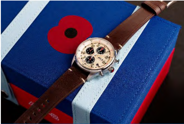
AVI-8 release RBL Tri Service watch

This month our timepiece partner, AVI-8, is releasing the AVI-8 Flyboy Royal British Legion Tri-Service Chronograph. The limited-edition timepiece commemorates and celebrates the three branches of the British Armed Forces, with a design inspired by the no-nonsense legibility and aesthetics of 1980s era military issue timepieces. A portion of every sale is donated to RBL.