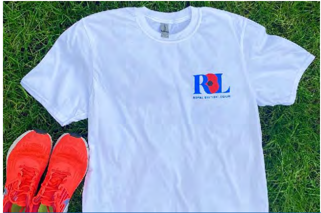
Do you feel ready to walk 100 miles in April?

Join us for a brand new walking challenge this spring. 100 miles sounds like a lot but you can complete the challenge any way you like, a few miles, a few steps or an epic weekend walk to clock up the miles. Sign up today and join the Walk 100 Miles in April Facebook group , get your FREE t-shirt and set up your fundraising page on Facebook to raise money for our Armed Forces community.