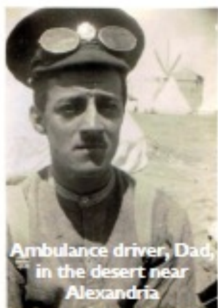
Ambulance driver, Dad, in the desert near Alexandria

29 Division arrived in Alexandria on about 30th March 1915 as part of the Mediterranean Expeditionary Force.