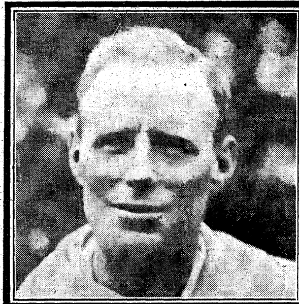
Captain James Ernest Newlands (Australian Infantry), who on three separate occasions displayed the most conspicuous bravery and devotion to duty in the face of heavy odds.