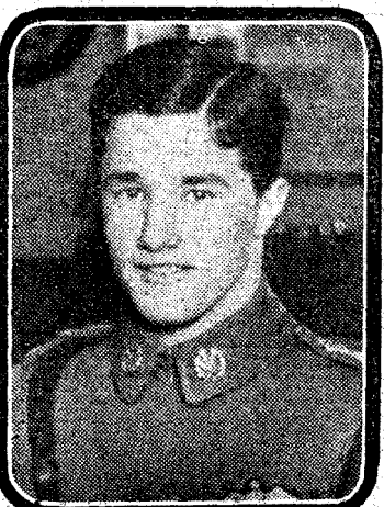
Captain Albert Ball, D.S.O., M.C., Croix de Guerre, the young Nottingham airman, who was recently killed. In all he destroyed forty-three German aeroplanes and one balloon.