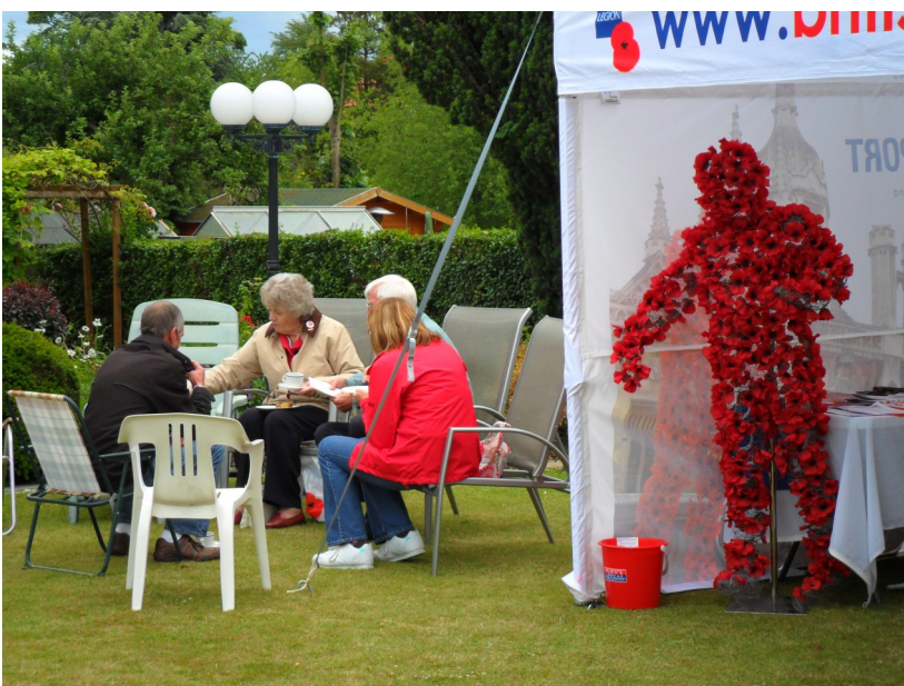
Poppy Man enjoying the Poppy Party!