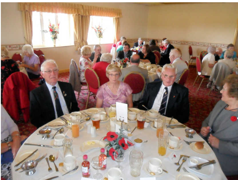
One of the Warsop branch tables at the County Lunch