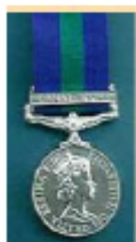
Canal zone medal