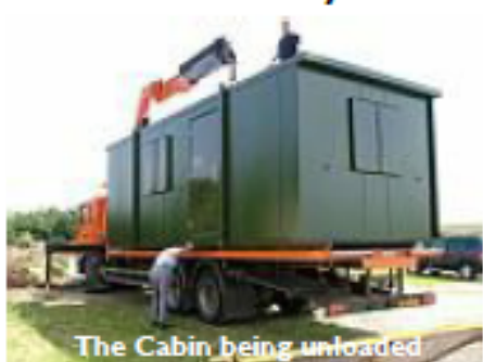
The Cabin being unloaded

What is greater than God, more evil than the devil, the poor have it, the rich need it, and if you eat it, you'll die?