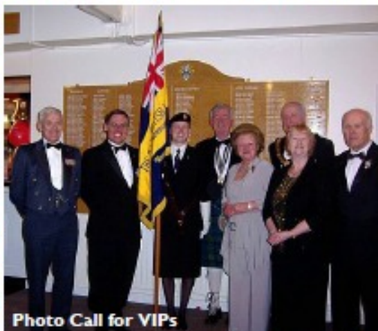
Photo Call for VIPs