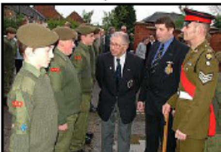
Photo taken on 29 April 2004 on the occasion of the Affiliation of the M H ACF Detachment at their HQ in Coventry Road

April starts on the same day of the week as July in all years, and January in leap years. April ends on the same day of the week as December every year. The birthstone of April is the diamond, and the birth flower is typically listed as either the Daisy or the Sweet Pea.